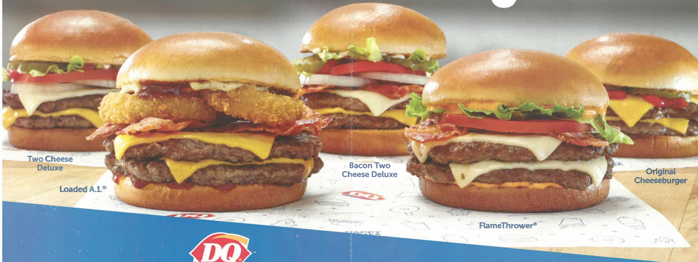
Two Cheese Deluxe